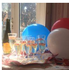
Royal Wedding Celebration tea