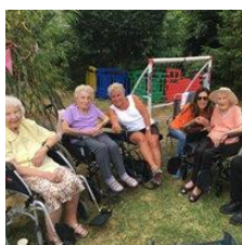
Visit to the Old Forge Nursery